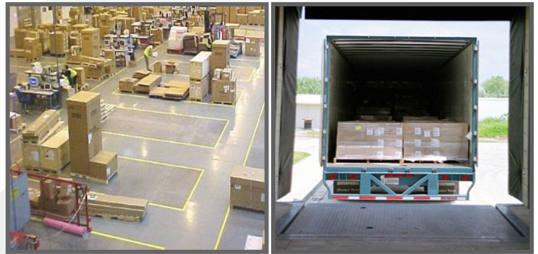
Customised receiving, pick, pack and shipping solutions.