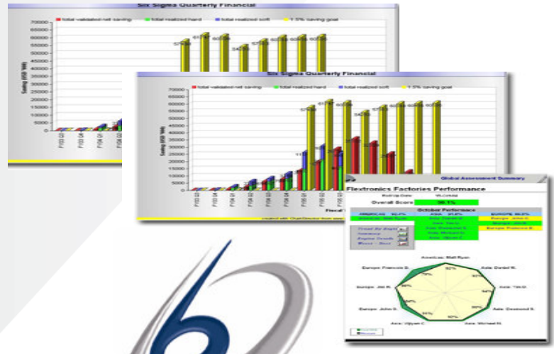
Comprehensive performance management framework